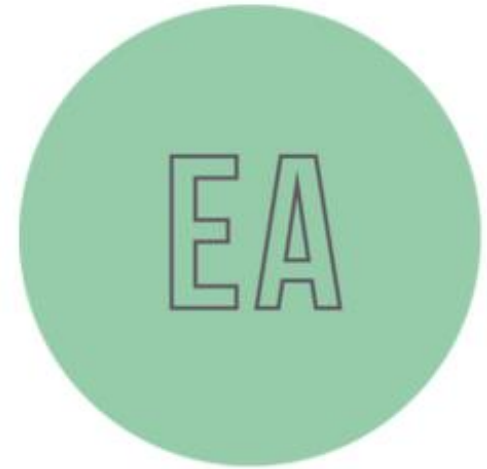
WHAT DOES MY VP EXTERNAL DO?