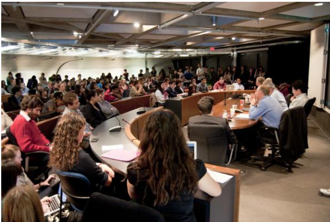
Photograph of the February 2013 "Battle of the Profs" event in Leacock 232, debating the idea of McGill divesting its financial investments from fossil fuels 16.

The Divest McGill 15 campaign launched in this year with the aim of pressuring McGill to divest its holdings in tar sands extraction companies and companies irresponsibly extracting resources with a focus on Quebec's Plan Nord. The campaign was characterized by a generally positive tone and actions, lively debate, and an extensive petition to McGill's Board of Governors Committee to Advise on Matters of Social Responsibility). The campaign was seen as polarizing by some, caused tensions with some groups of students, especially the Engineering Undergraduate Society (EUS), and brought many people together for a 6-professor debate at the "Battle of the Profs" event co-organized with the Economics Students Association (ESA). The petition to the Board of Governors was rejected by its Committee to Advise on Matters of Social Responsibility though there was discussion at the May 2013 Board of Governors meeting on the need to update the CAMSR Terms of Reference, which is happening in the second half of 2013.