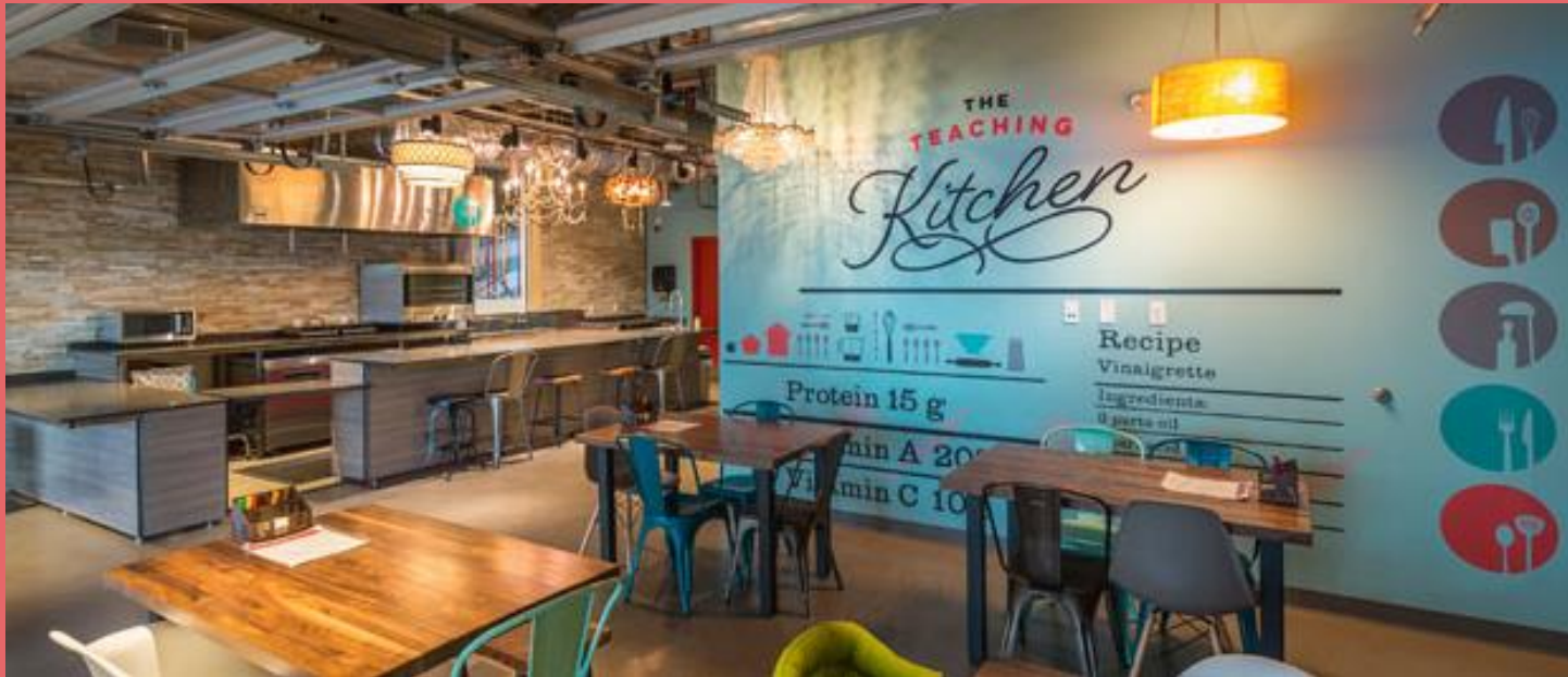
Future Nutrition Kitchen

Athletics and Recreation staff have consulted with leaders from SSMU and PGSS to discuss facility plans for the future.