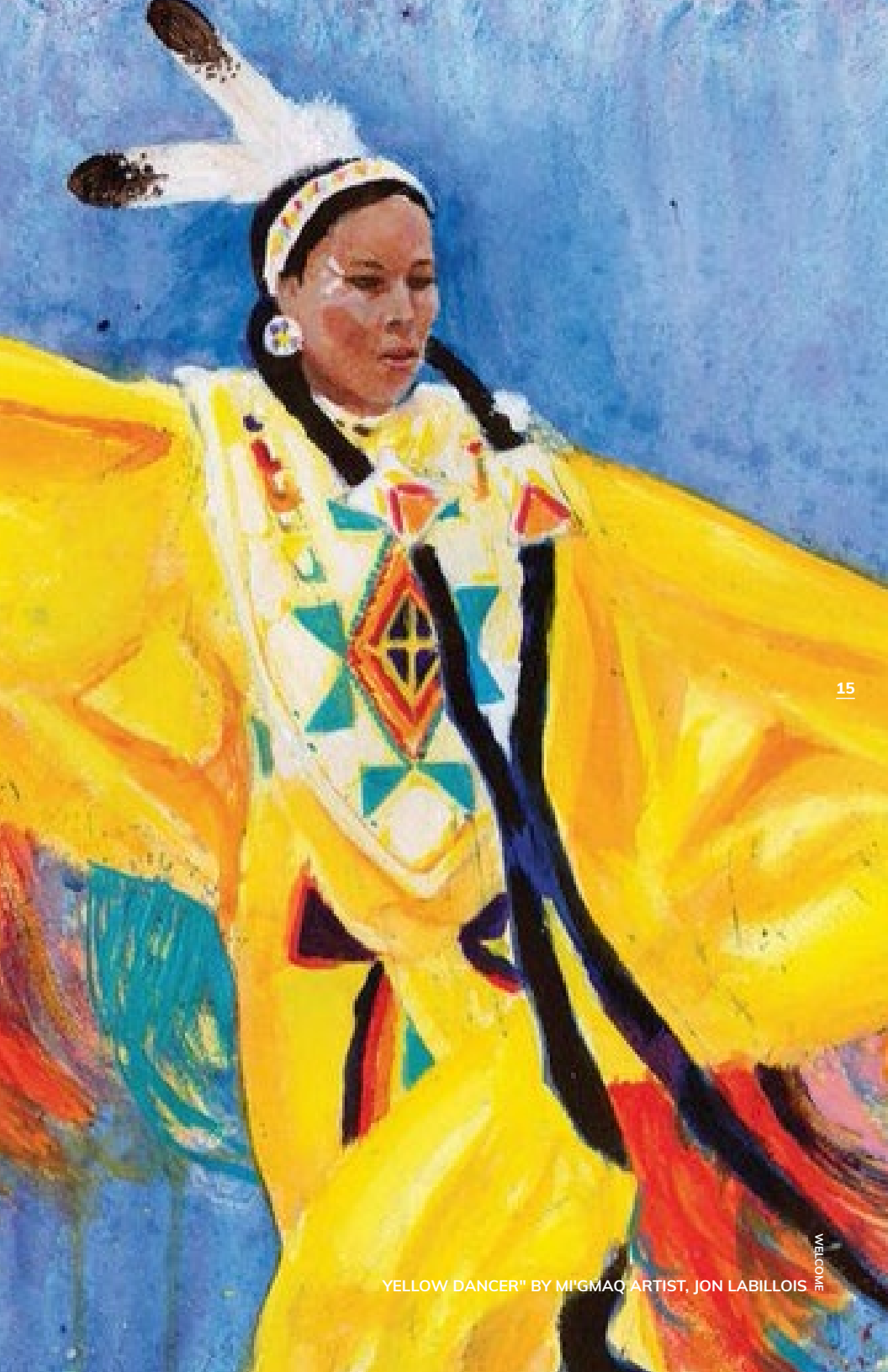
YELLOW DANCER™ BY MI'GMAQ ARTIST, JON LABILLOIS