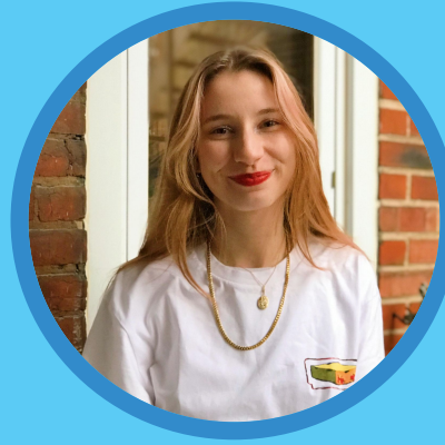
EVE (SHE/HER) EXTERNAL AFFAIRS COMMISSIONER