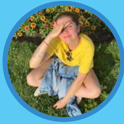
ISA (SHE/THEY) COMMUNITY AFFAIRS COMMISSIONER